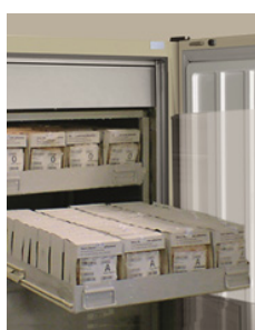
Custom made drawers upon request