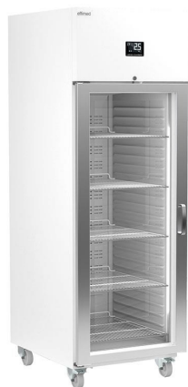
Laboratory cold storage - Refrigeration +2 / +8°C - Perfect Line