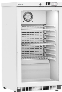
Refrigeration for Pharmacies - Pharma Refrigerator +2 / +8°C - Perfect Line